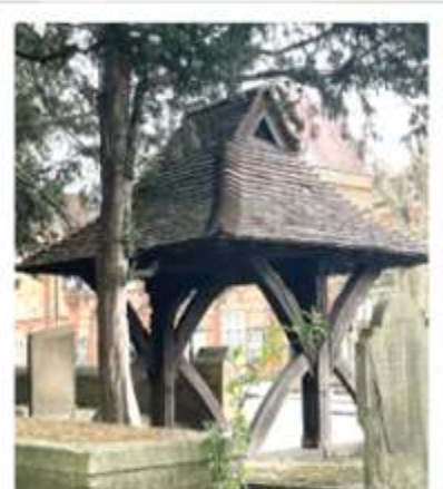
13 th century lych gate

Memorials, tombs and coffins changed over time. Conspicuous tombs indicated wealth and sometimes profession. By the 19 th century steel-lined, lockable coffins were prevalent to deter body-snatchers, keen to make money by providing cadavers to anatomists. Nicholas informed us that a typical medieval churchyard might contain 5000 burials and that in areas where flooding happened regularly, the church yard would be artificially raised to prevent graves from being flooded and corpses exposed.