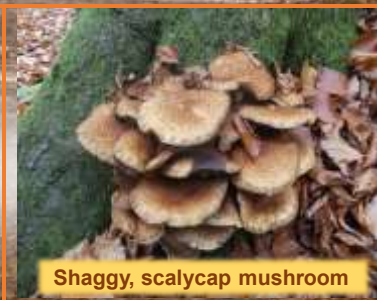
Shaggy, scalycap mushroom