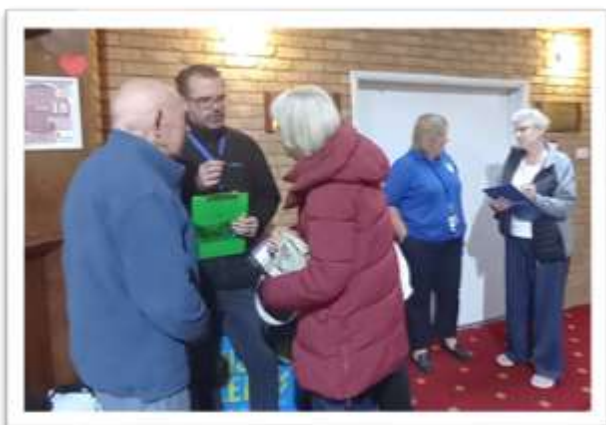
u3a Members were interested to find out more about the Driving with Confidence course.

With the bad weather coming, it is advisable to keep blankets, a pre-charged mobile phone power bank and a shovel in the car. Even if we don't need it, we may be able to help another motorist who does.